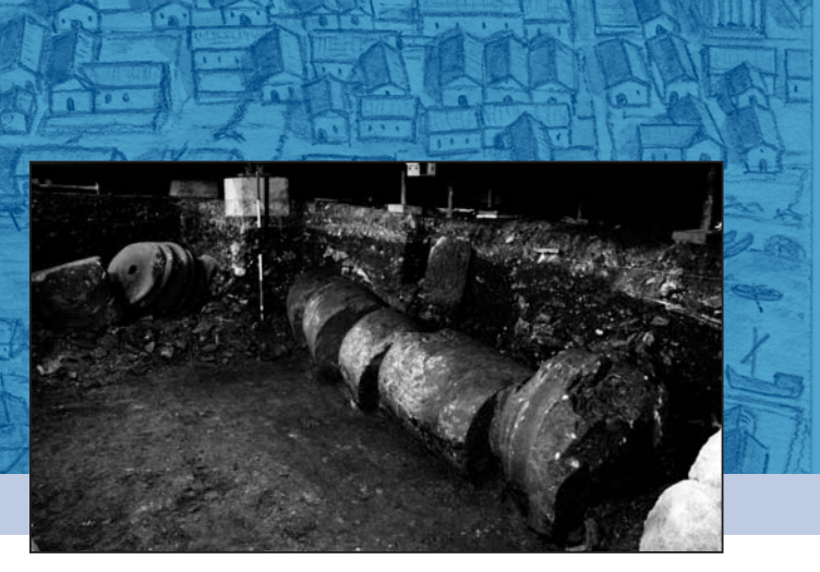
Photo of the collapsed Roman column as found by archaeologists beneath the Minster

The junction of Petergate and Stonegate lies on the site of the junction of the two most important streets of the Roman fortress, the via praetoria which led to the main gate (St Helen's square), and the via principalis which joined the north-west and south-east gates (at Bootham Bar and King's Square).