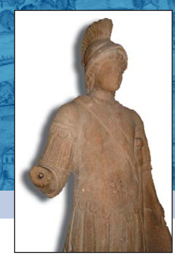
Statue of the God Mars