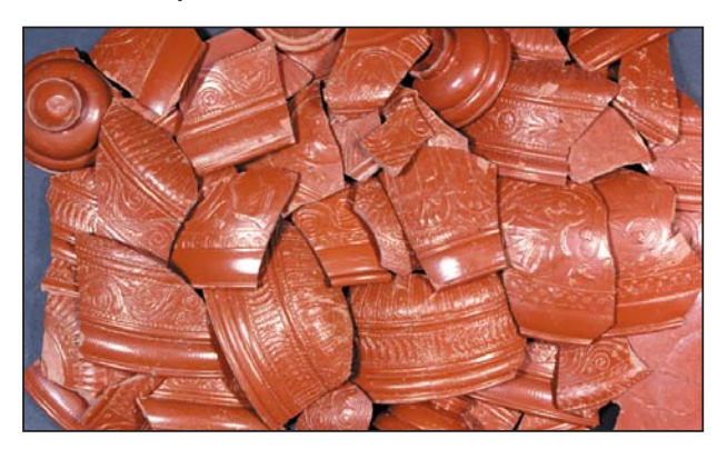
Roman Samian Ware from York

The museum gardens are also home to one of the finest collections of Roman artefacts in Britain. The Yorkshire Museum recalls in fascinating detail the history of the Roman settlement of Eboracum.