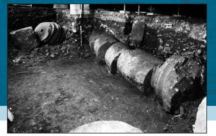
Photo of the collapsed column as found by archaeologists beneath the Minster