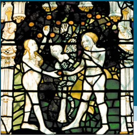
Adam and Eve; York Minster contains some of the finest stained glass in the world

The first York Minster was built in 627, and was probably a humble, circular, wooden building, very unlike today's great Cathedral. The Minster you see today was begun in 1220 and took thousands of men over 200 years to complete. It was built to glorify God, and to symbolise the richness of His kingdom on Earth. It holds the largest and most important collection of Medieval Stained Glass in the World and the entire building is adorned, inside and out, with elaborate carvings in stone and wood.