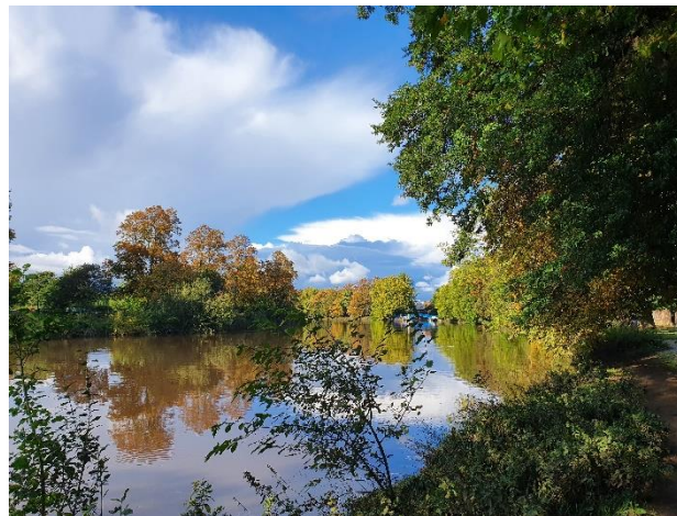
View from New Walk