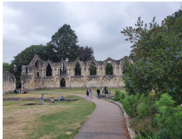
St Mary's Abbey in the Museum Gardens