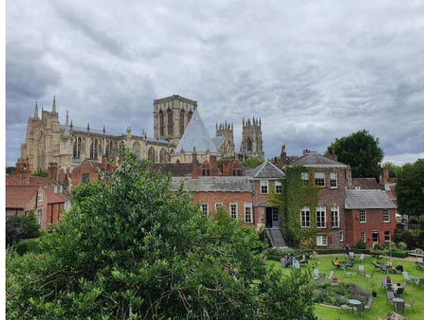
York Minster from the City Walls